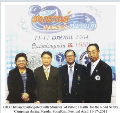
BJD Thailand participated with Minister of Public Health for the Road Safety Campaign during Popular SongKran Festival April 11-17, 2011

In Thailand representatives from the NAN participated in the Road Safety Campaign during the popular Song Kran Festival.