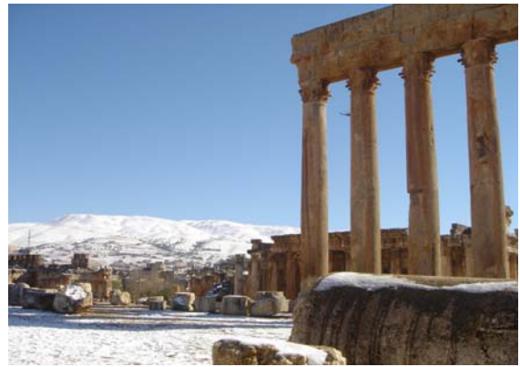
Baalbek, Lebanon's sacred fortress

The world-class summit featured an outstanding agenda with more than 15 key world opinion leaders as well as representatives from BJD National Action Networks, including experts from orthopaedics, rheumatology, rehabilitation, public health, patient organizations, societies and syndicates, journal editors and other relevant backgrounds.