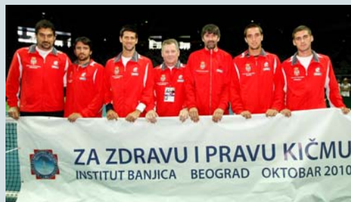
Serbian world wide best ranked national sports team of waterpolo, tennis and basketball joined the action.

In Serbia , the network expanded to include the Spine Group of Serbia. Working with the Ministry of education, all schools in Serbia dedicated one class of physical education to spine problems and the importance of exercise. Several instructive courses were organized for medical staff from all of Serbia.